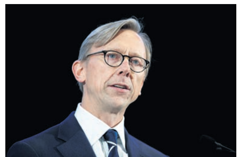
In this Nov. 29, 2018 file photo, Brian Hook, U.S. special representative for Iran, speaks at the Iranian Materiel Display at Joint Base Anacostia-Bolling in Washington.

The four nations have also pointed to Qatar's close